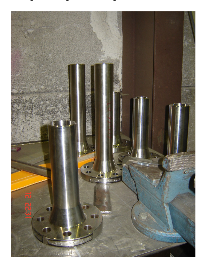
Operations: forging, machining, testing